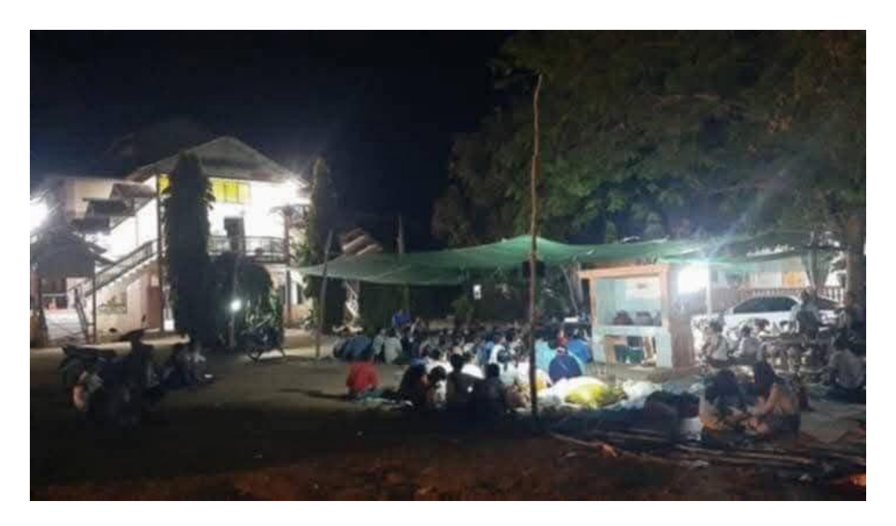
Figure 4: Earthquake survivors from a village in Pyawbwe Township