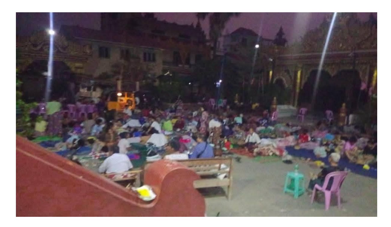
Figure 1: Earthquake survivors in Mandalay, 33×34, 76×77