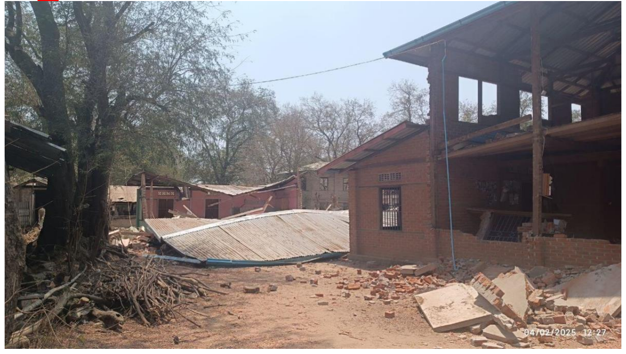
Figure 3: A village in Pyawbwe Township