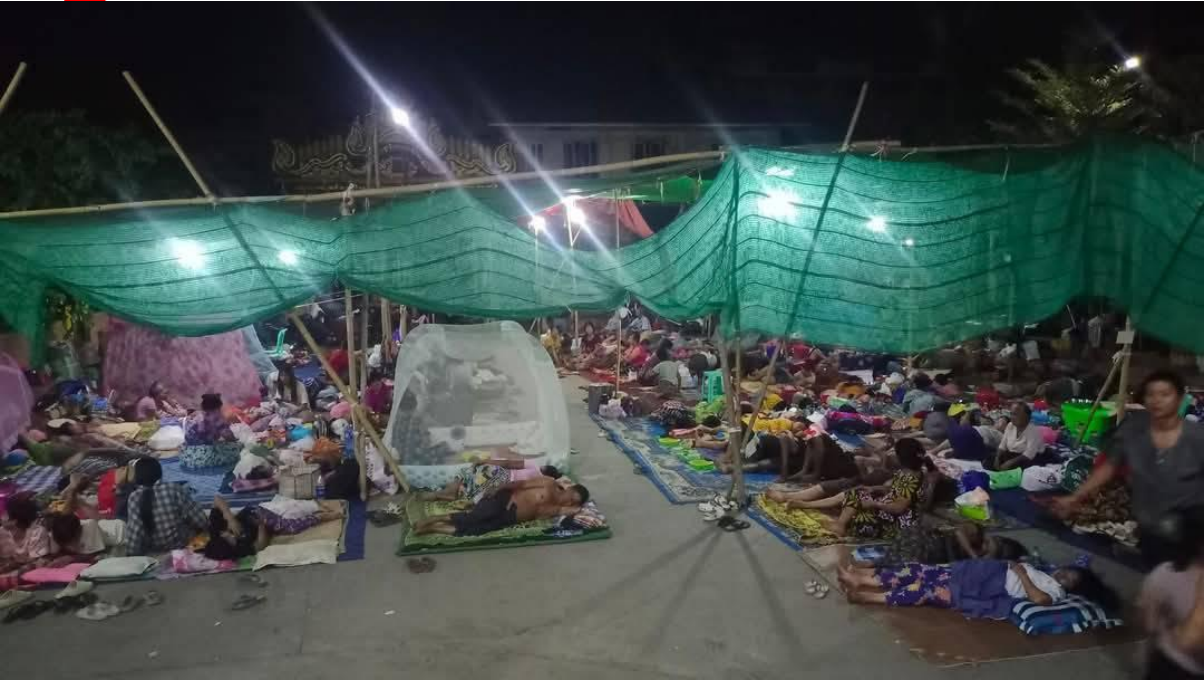
Figure 2: Earthquake survivors in Mandalay, 33×34, 76×77