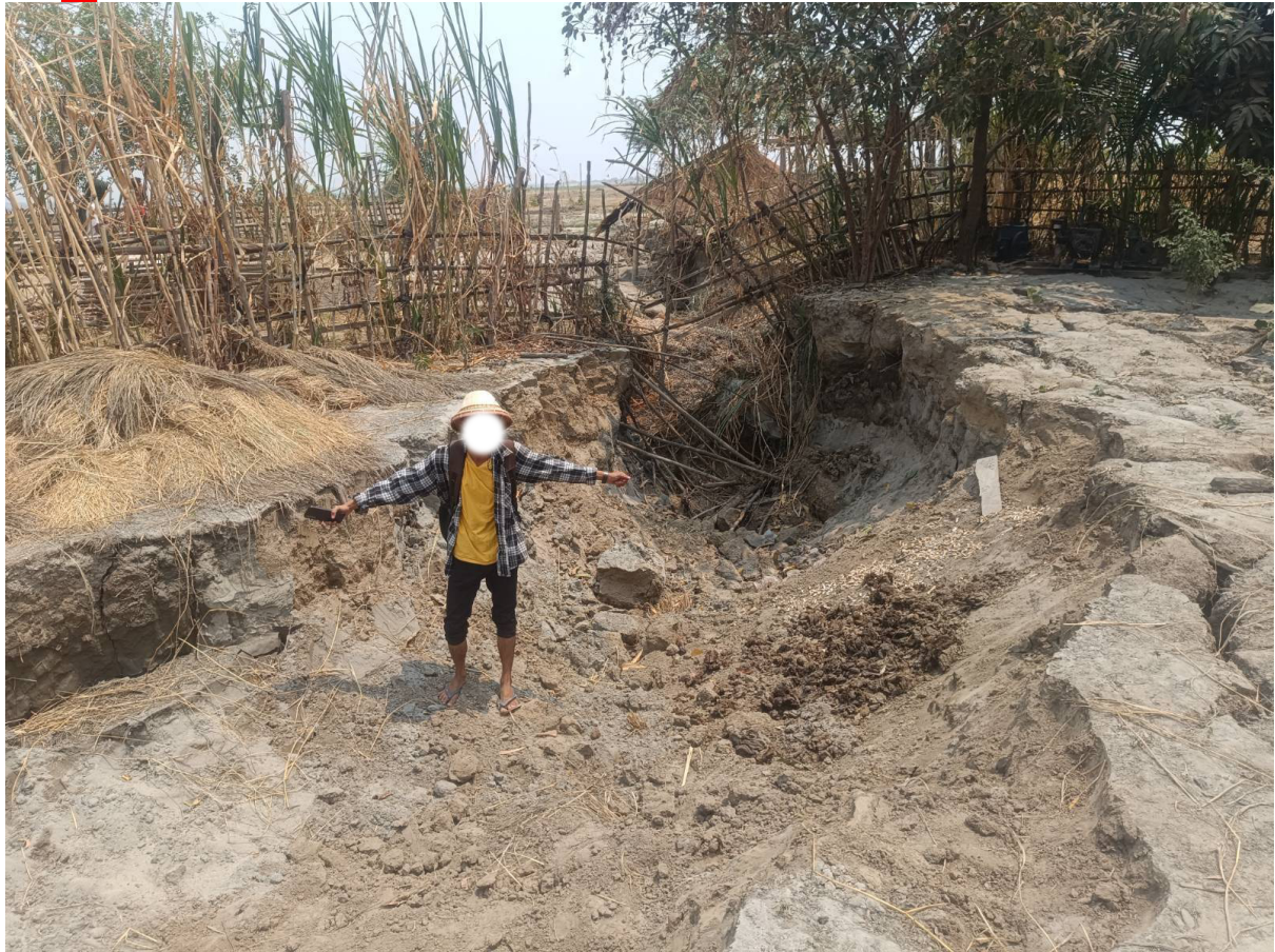
Fig (1) – The Sagaing Fault