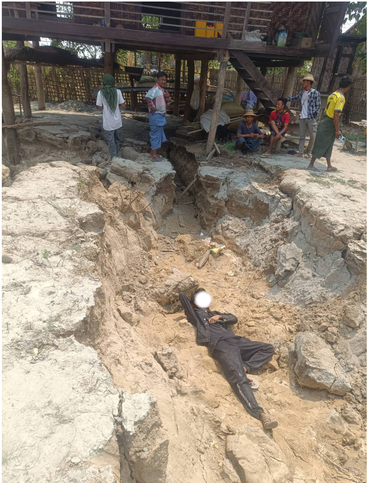
Fig (2) – The Sagaing Fault